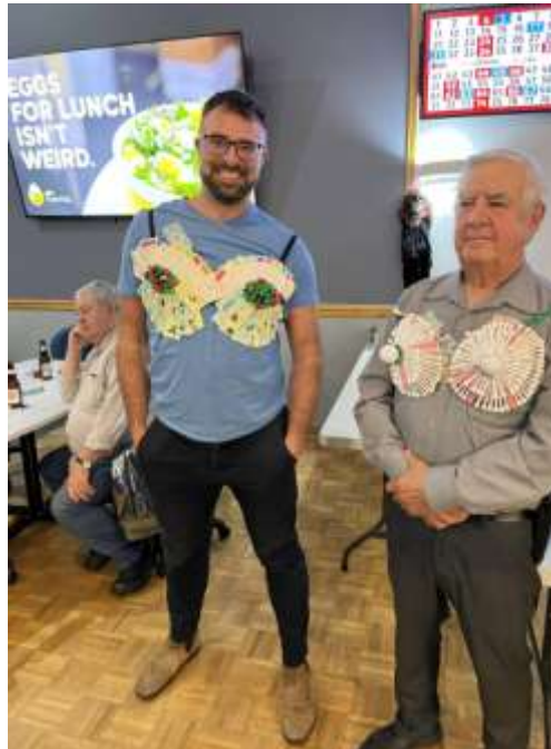
Our Aerie Brothers modeling the fabulous bras designed for "Bras for a cause" fundraiser in 2022.