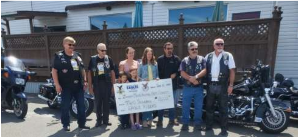
Presenting cheque in the amount of $2,000.00 to the Z M Animal Farm Society