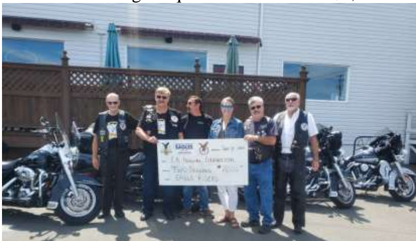
Presenting a cheque in the amount of $2,000.00 to the Campbell River Hospital Foundation