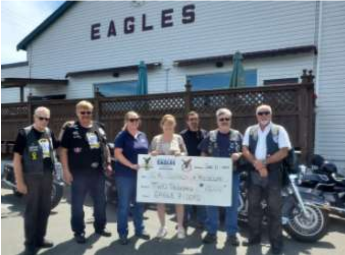
Presenting a cheque in the amount of $2,000.00 to the Campbell River Search and Rescue