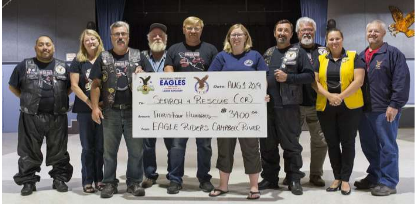
Campbell River Search and Rescue

Donation of $3400.00 to each of their Charities, Campbell River Search and Rescue and The Kidney Foundation, that's an increase of $400.00 to each Charity from last year.